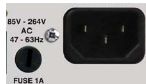
Fig 4-11: PS-AMP IEC Power Plug & Fuse.