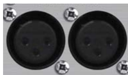
Fig 2-6: PS-SEND XLR Analogue Inputs.