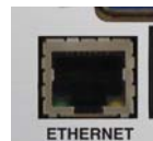
Fig 2-12: PS-SEND ETHERNET Port.