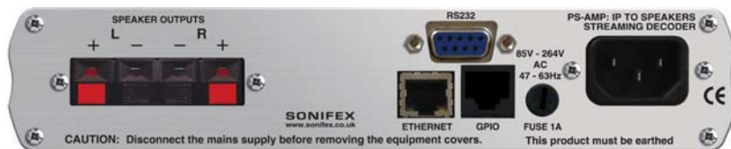
Fig 4-7: PS-AMP Rear Panel.