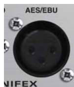
Fig 2-8 PS-SEND AES/EBU Input.

The signals on this connector should meet the IEC 60968 specification