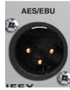
Fig 3-10: PS-PLAY AES/EBU Output.

Yellow LED: On power up, flashes periodically while waiting for a