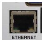
Fig 3-14: PS-PLAY ETHERNET Port.