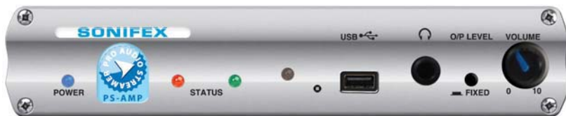
Fig 4-1: PS-AMP Front Panel.

The PS-AMP is a freestanding unit which converts an IP audio stream directly to speaker outputs. It is also available in a 1U rack-mount as the PS-AMPS. The PS-AMP has the same feature-set as the PS-PLAY except that there are no individual audio outputs other than the speaker terminals. The PS-AMP uses an integrated 2 x 15W D-class amplifier to deliver audio directly to a pair of connected speakers.