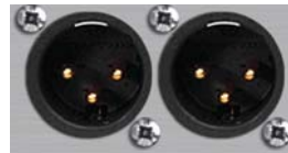
Fig 3-8: PS-PLAY Analogue Outputs