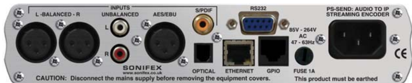
Fig 2-5: PS-SEND Rear Panel.

All the audio connectors together with the ethernet, serial and GPI/O connectors are found on the rear panel of the unit. All the audio connections are inputs on this unit.