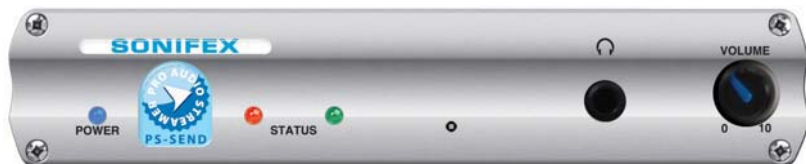
Fig 2-1: PS-SEND Front Panel.

Power to the unit is via a universal supply 85V - 264V fused IEC mains socket.