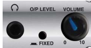
Fig 3-6: PS-PLAY Headphone Socket, Volume Control & Output Level Control.

The headphone output has its own volume control and has a maximum output level of +12dBu.