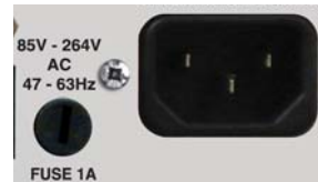
Fig 3-16: PS-PLAY IEC Power Plug & Fuse.

The fuse socket is where the anti-surge fuse 1A 20 x 5mm fuse is inserted. Please unplug the unit whenever opening this cover.