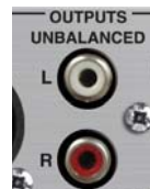
Fig 3-9: PS-PLAY RCA Phono Analogue Outputs.