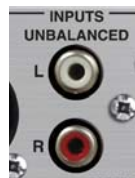
Fig 2-7: PS-SEND RCA Phono Analogue Inputs.