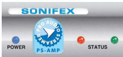
Fig 4-2: PS-PLAY Power & Status LEDs

There are two LEDs, red and green, which together indicate boot up errors and when data is being received. The LEDs have the following meanings: