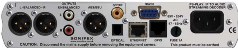
Fig 3-7: PS-PLAY Rear Panel.

All audio connections are outputs on this unit.