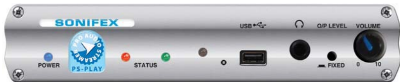
Fig 3-1: PS-PLAY Front Panel.

The rear panel has 2 x RJ45 connectors, one for the 10/100Mbit Ethernet interface and one for GPIO connections. The PS-PLAY has 2 output relay contacts which can be triggered remotely over IP from a connected PS-SEND unit. There is a 9 way D-type RS232 serial connection for control of the unit by automation systems and for firmware updates. The unit can be remote controlled via serial connection, TCP or UDP and remote management of the unit is also possible using SNMP traps.