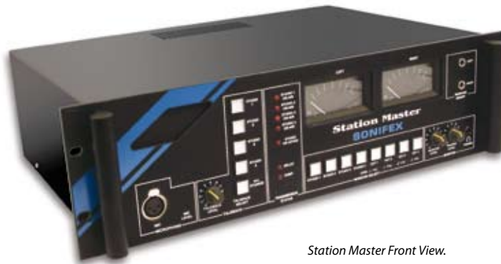
Station Master Front View.

Station Master is part of the Sonifex range of professional audio products designed for building radio stations on a budget. It combines into a single package all the equipment required for audio distribution, studio switching, talkback and monitoring for up to 4 studios.