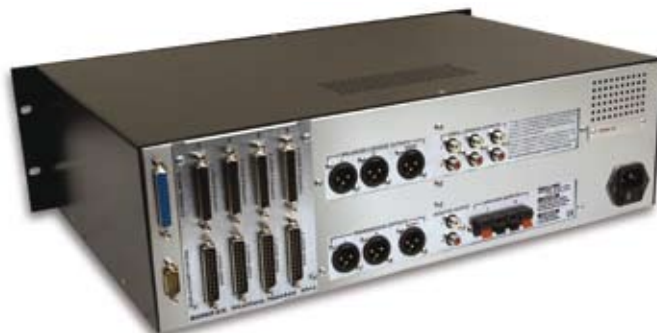
Station Master Rear View.

// Station Master combines all audio distribution, studio switching, talkback and monitoring equipment into a single package. //