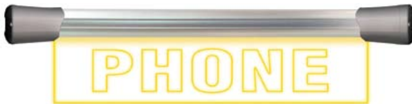
LD-40F1PHN Single Flush Mounting 40cm 'PHONE' Sign

Just select the name of the sign from the list below.