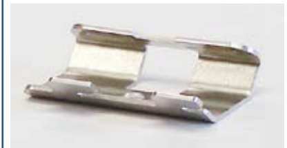
LD-IT LED Sign End Mounting Installation Tool

The display mode and colour options are set-up using an 8 way DIPswitch, accessible during installation.