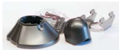
LD-KE1 End Mounting Kit For 40cm Or 20cm Flush Mounting Signs