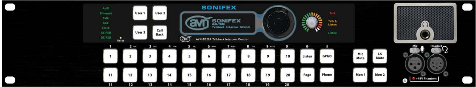
AVN-TB20AR Front View.