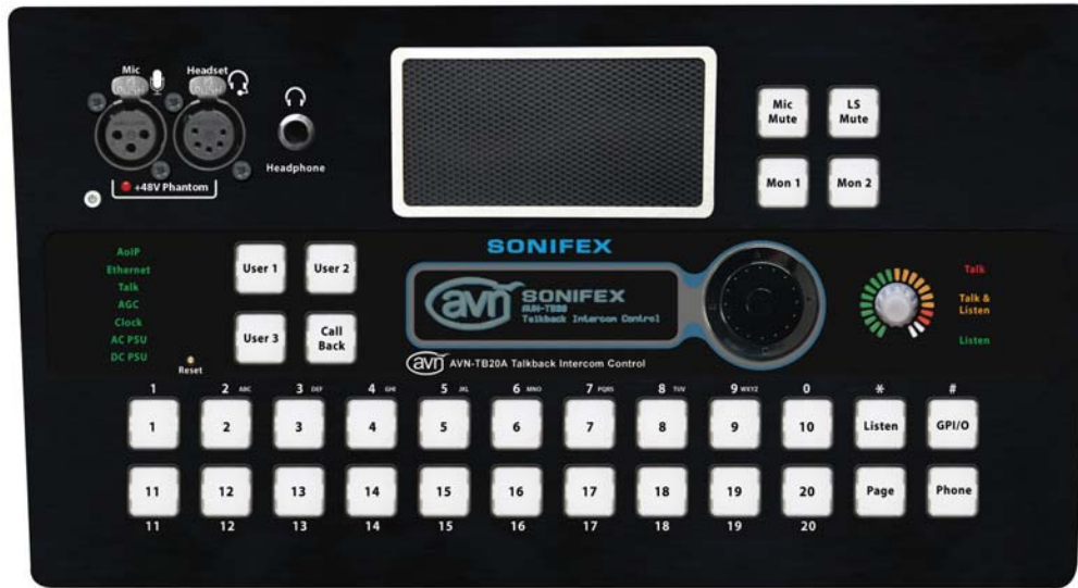
AVN-TB20AD Top View.