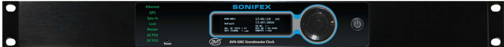
AVN-GMCS Front View.