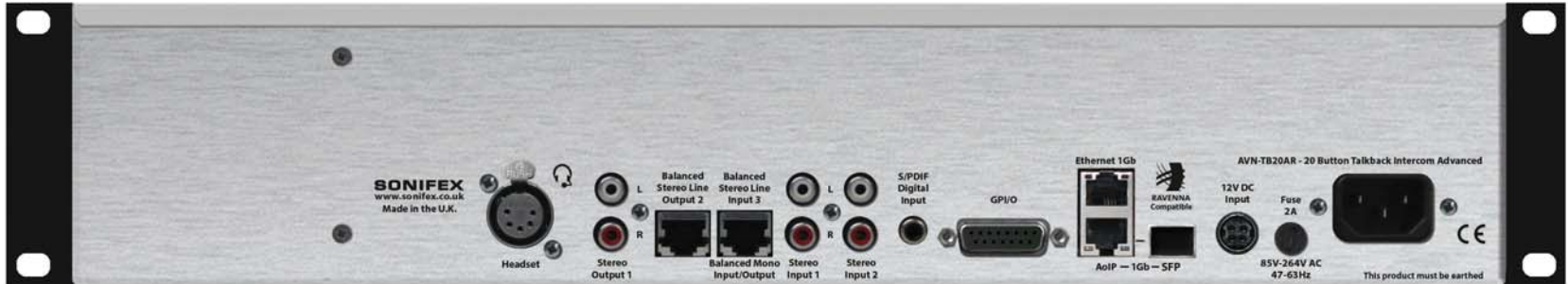
AVN-TB20AR Rear View.