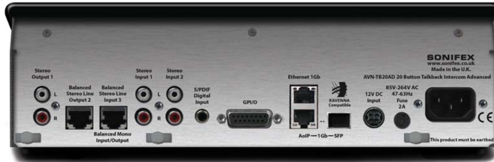
AVN-TB20AD Rear View.