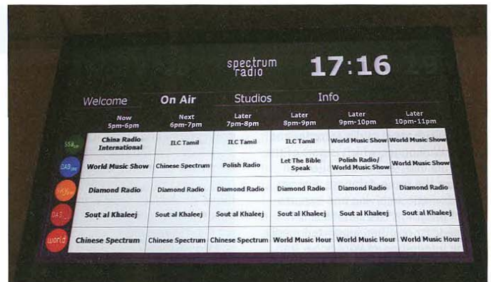
Spectrum's own software drives the display of forthcoming programs on each of its platforms.