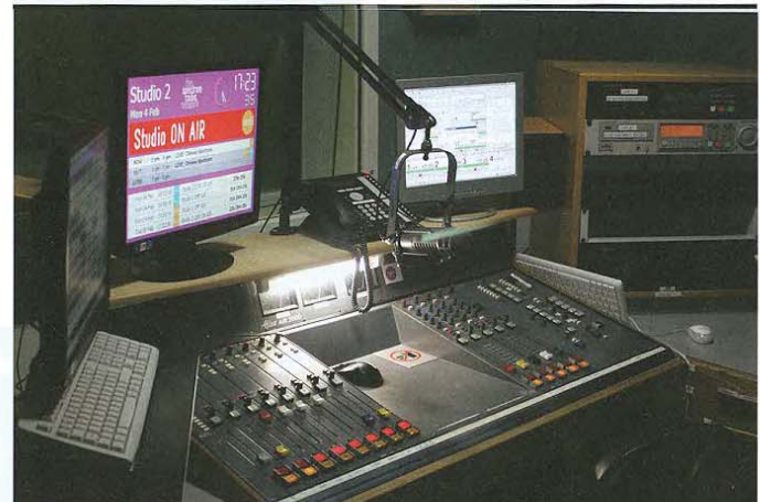
Studio 2 at London's Spectrum Radio, with the station's own switching system.