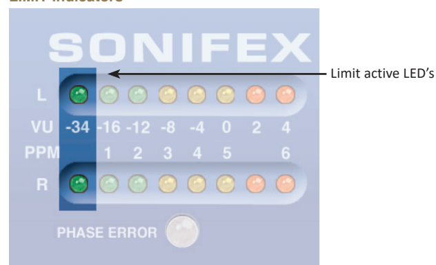
Fig 1-11: RM-CA2 & RM-CAD8 Meters & Phase Error LED

The LIMIT indicators are an additional function of the left hand LED (-34 VU) of the meter scales. When the level potentiometer gain is applied to the incoming signals the resulting signal can exceed the maximum input levels into the D-class amplifier. To avoid clipping or overflow conditions a limiter function is applied. The limiter is applied independently to each channel and has an instantaneous attack with a slow release.