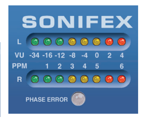
Fig 1-8: RM-CA2 & RM-CAD8 Meters & Phase Error LED